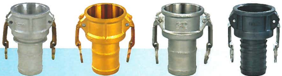
Coupleurs "C", à douille anelée Female coupler, Hose ringed shank