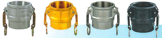
Coupleurs "D", à douille fileté femelle Female coupler, Female thread