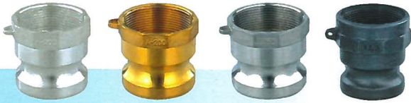
Adapteurs "A", à douille fileté femelle Male adapter, Female thread