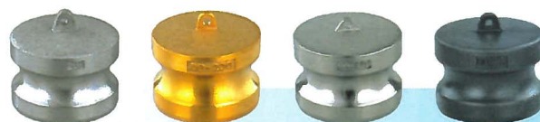
Bouchons adaptateur "DP" (obturation coupleurs) Adapters plugs "DP" (shutting couplers)