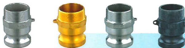
Adaptateurs "F", à douille fileté mâle Male adapter, Male thread