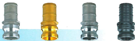
Adaptateurs "E", à douille annelée Male adapter, Hose ringed shank