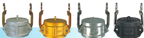
Bouchons COUPLEUR "DC" (obturation adaptateurs) Couplers plugs "DC" (shutting adapters)