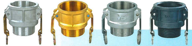
Coupleurs "B", à douille fileté mâle Female coupler, Male thread